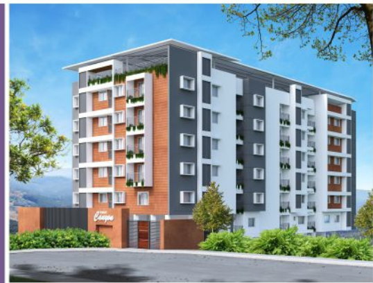
BHANDARY CANYON BEJAI, MANGALORE