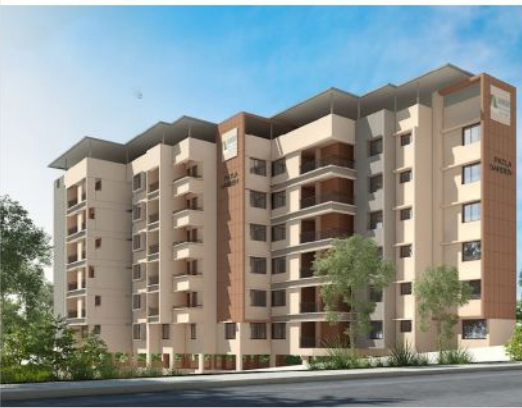
PATLA GARDEN DATTANAGARA, MANGALORE